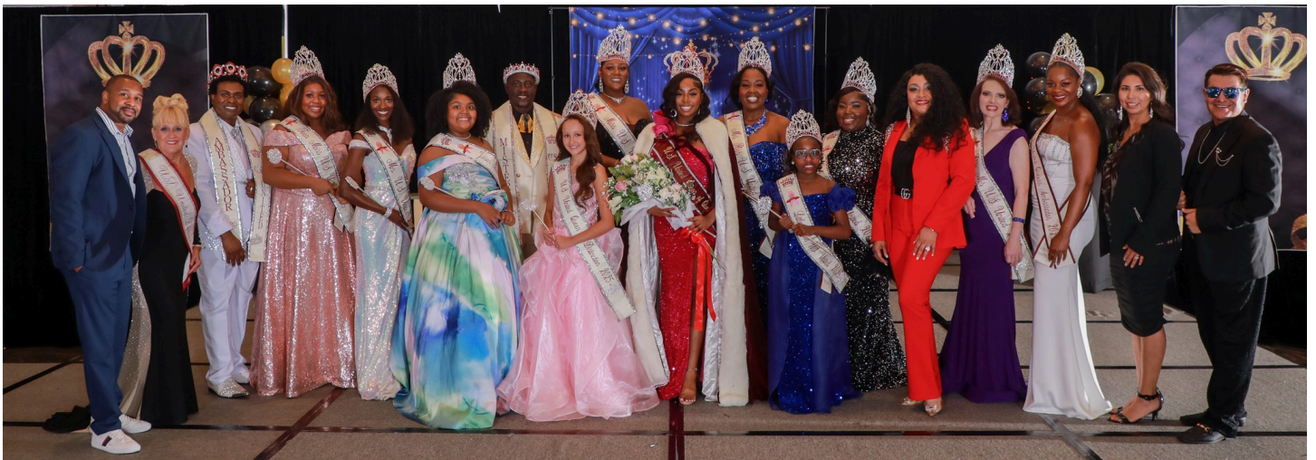
2025 National Royalty and Judges